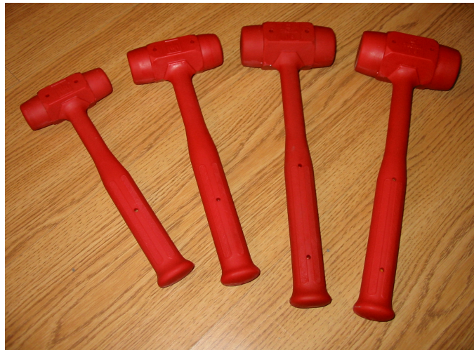
Elastomer hammers available in 0.5 - 0.8 - 1 and 1.5 kg